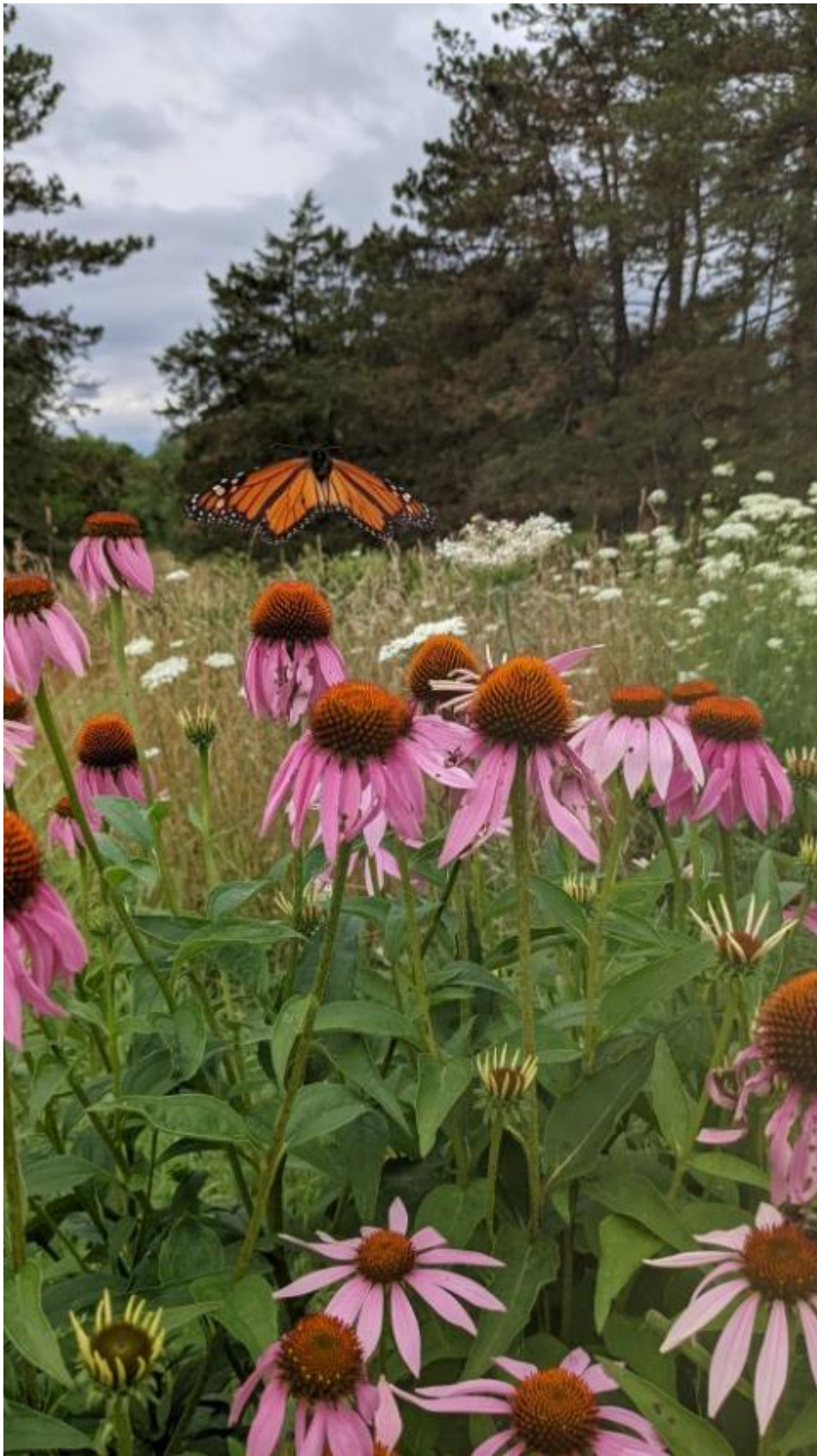
Flowers: In addition to land for farming, the Dominican sisters' property at Sinsinawa includes 10 acres of prairie and 10 acres of oak savanna.